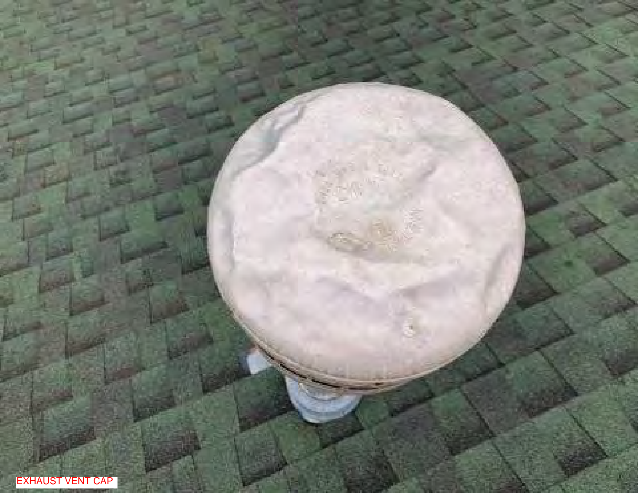
EXHAUST VENT CAP