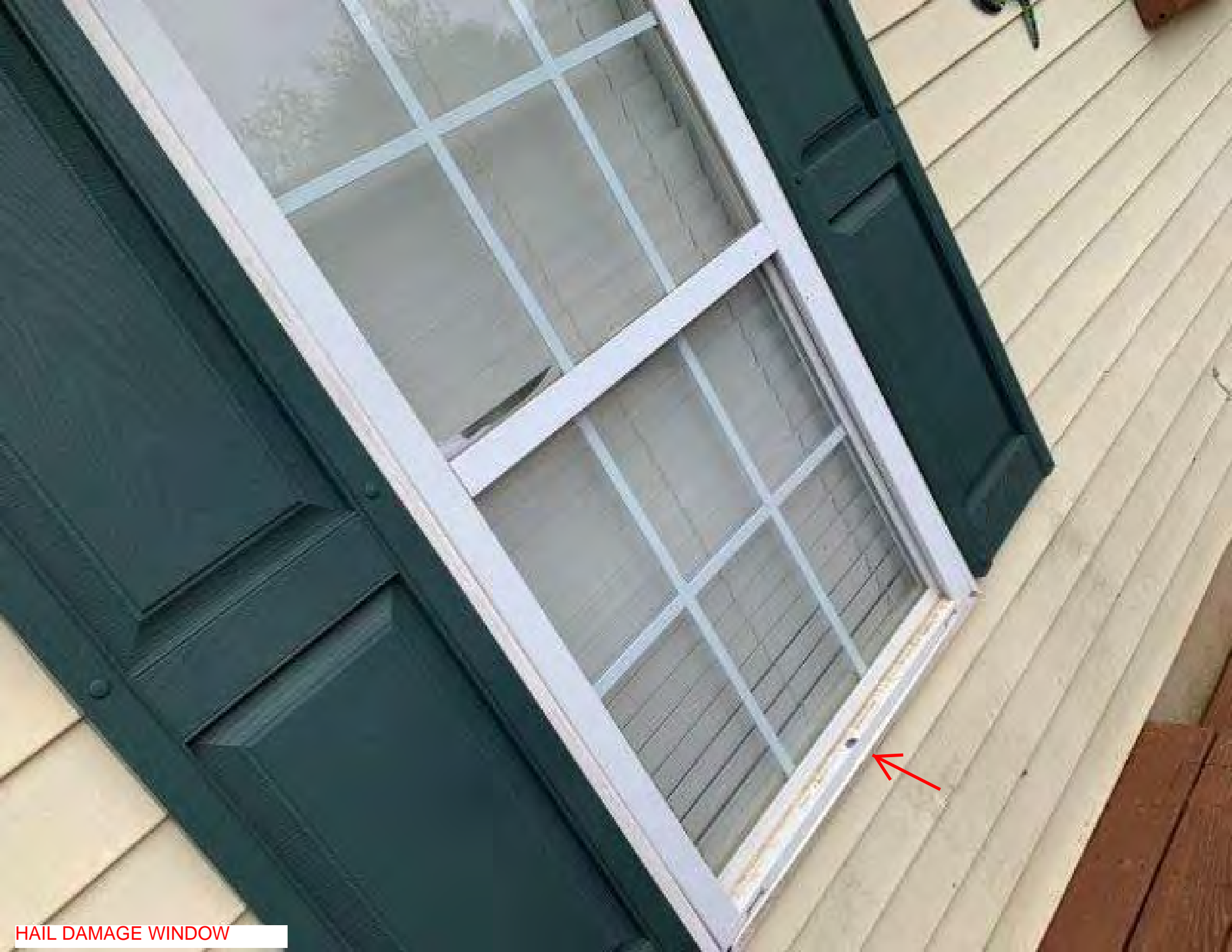
HAIL DAMAGE WINDOW