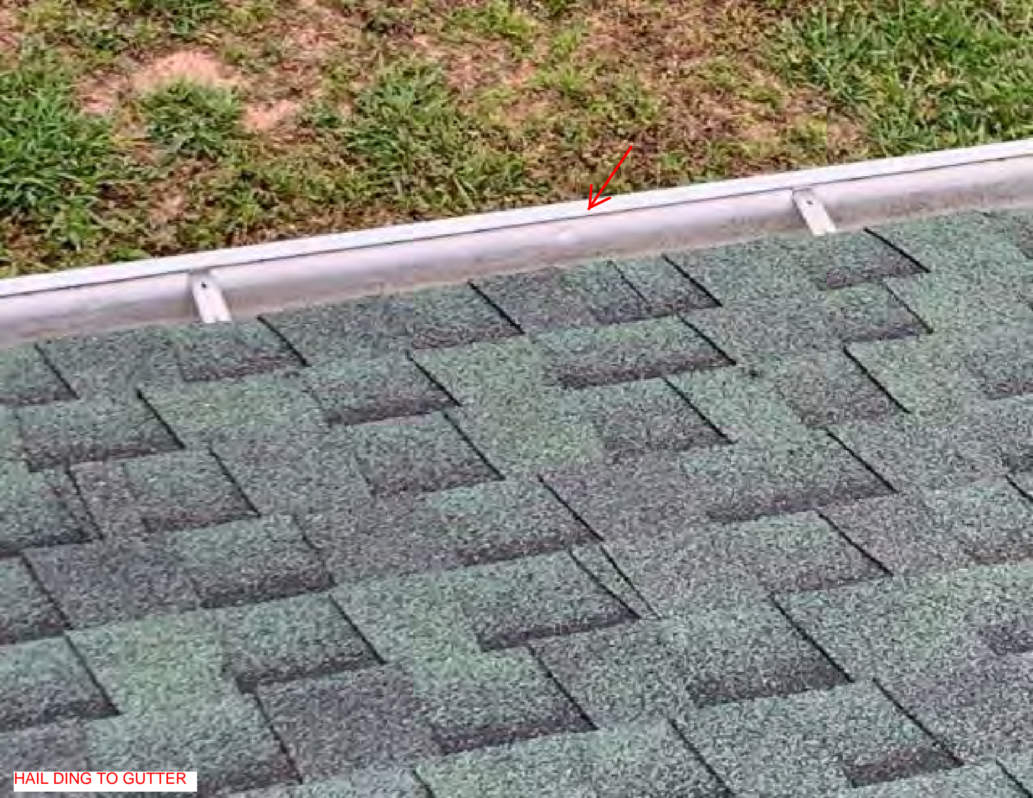
HAIL DING TO GUTTER