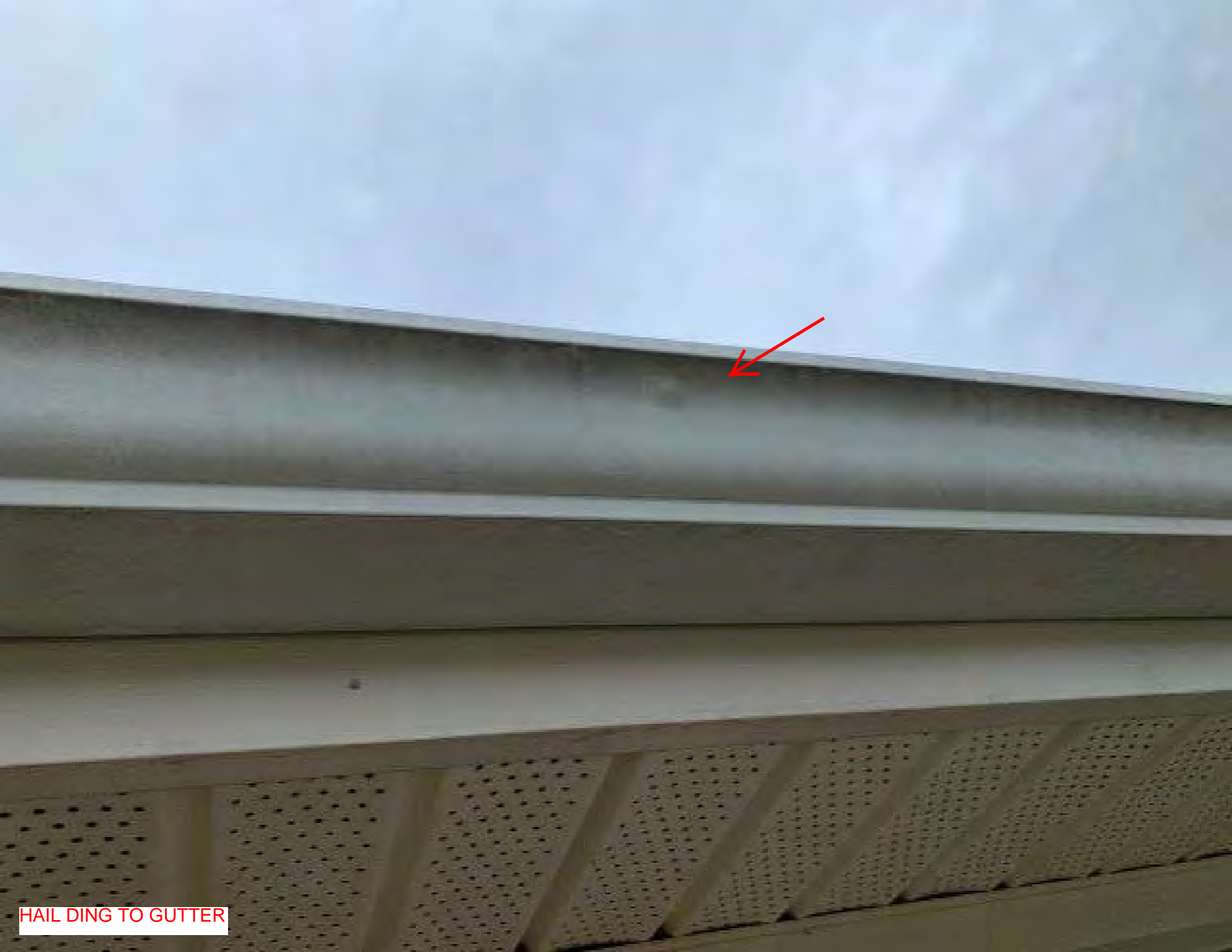
HAIL DING TO GUTTER