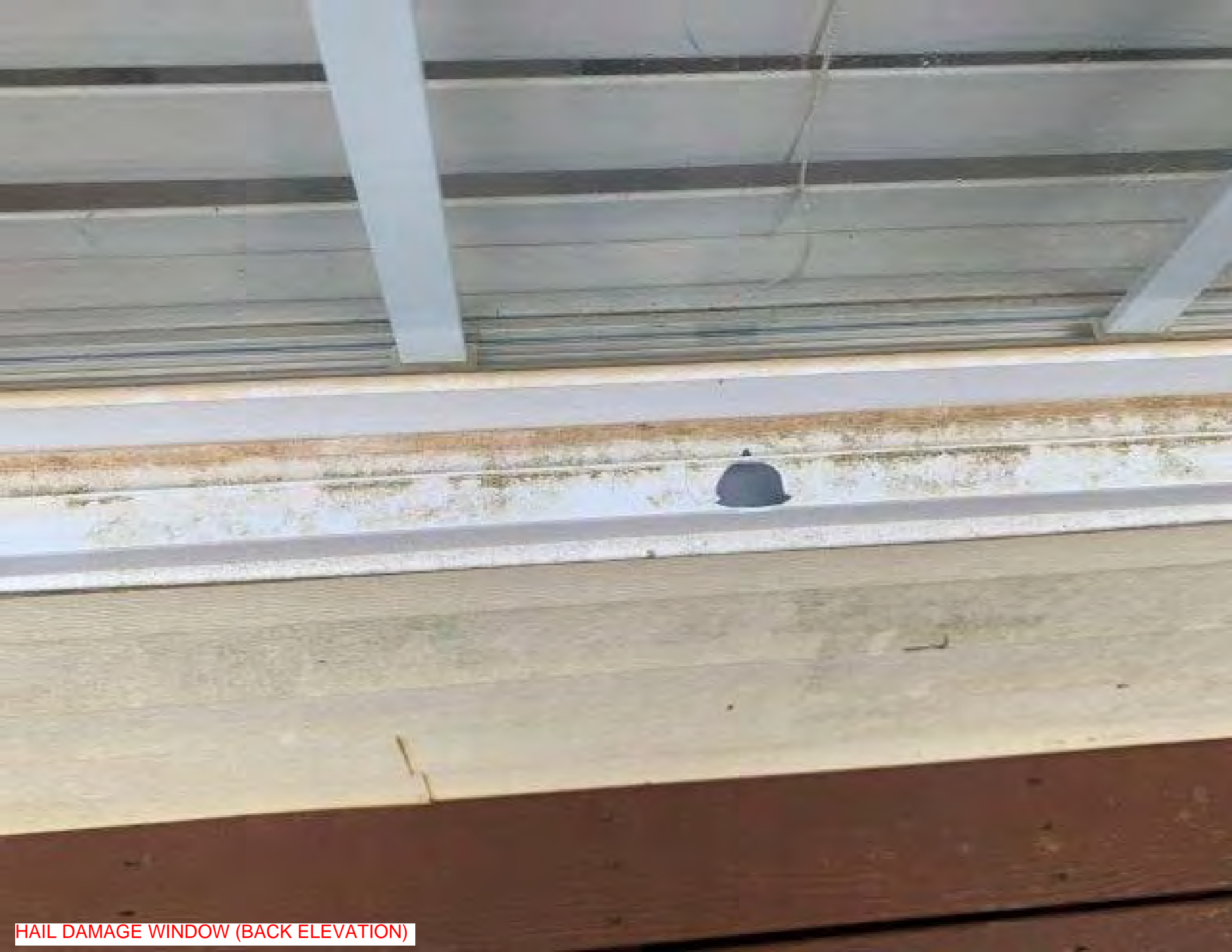
HAIL DAMAGE WINDOW (BACK ELEVATION)