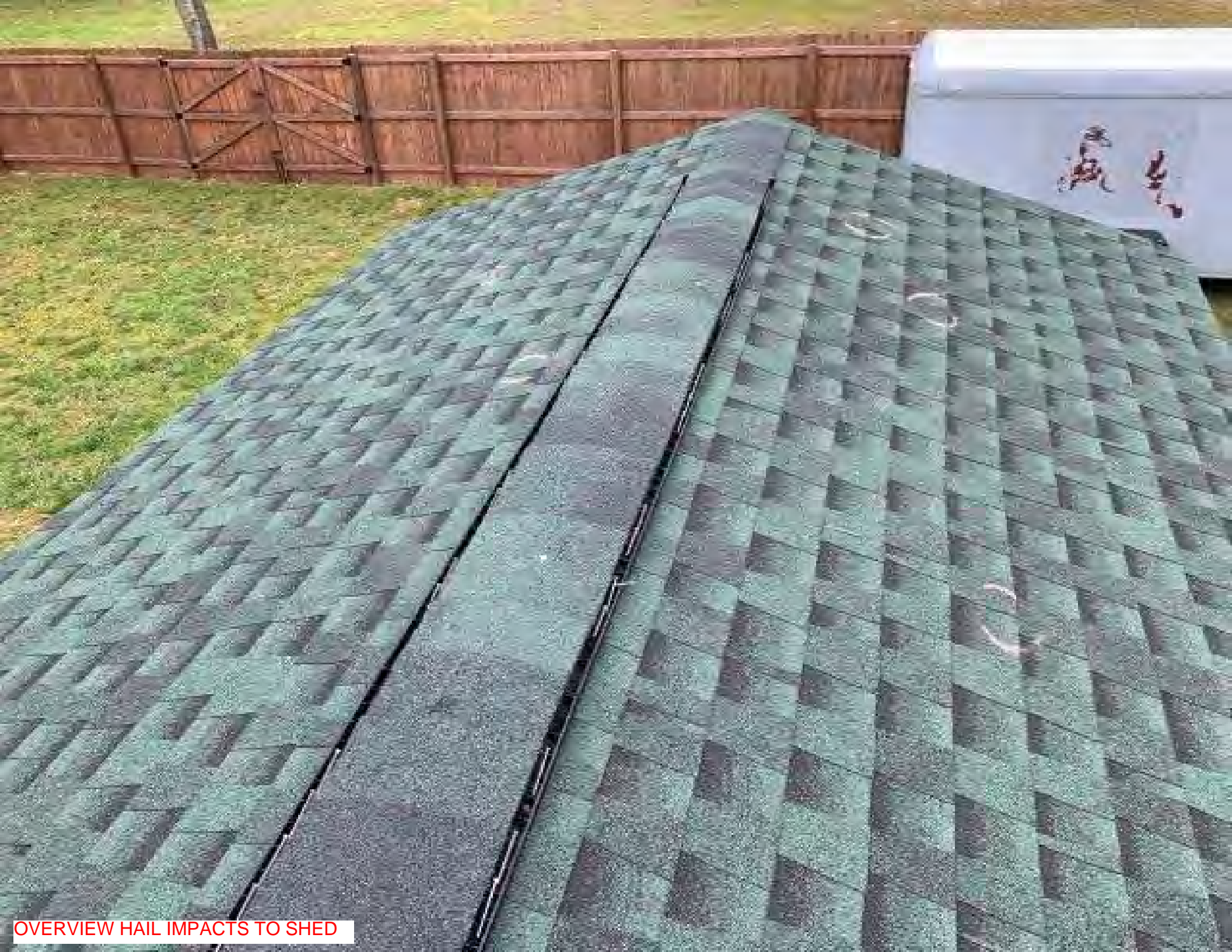
OVERVIEW HAIL IMPACTS TO SHED