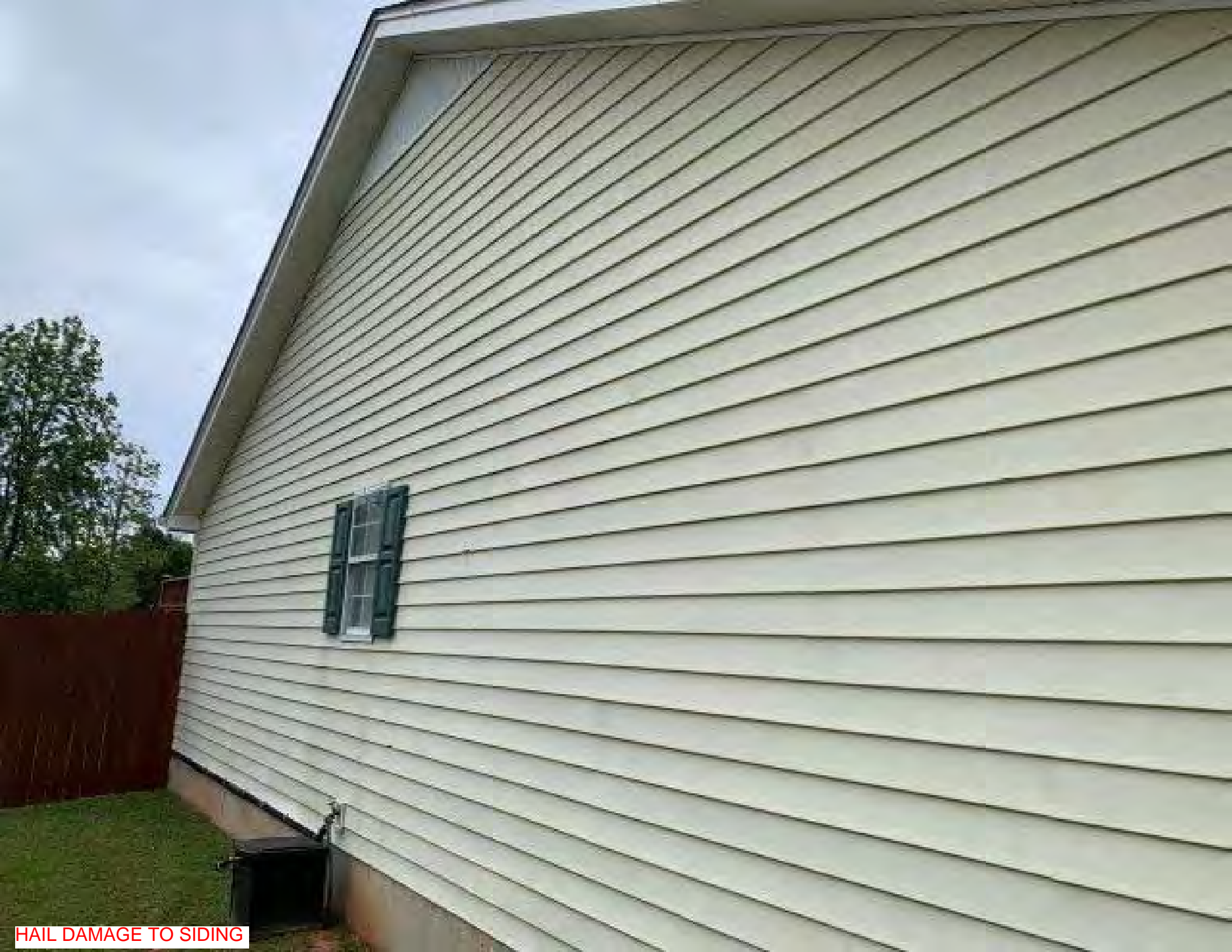
HAIL DAMAGE TO SIDING