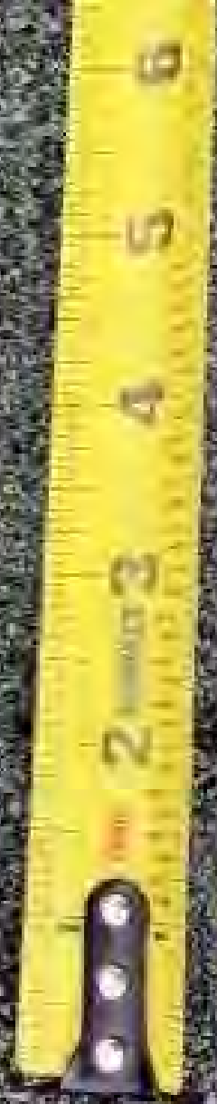
LARGE HAIL IMPACT