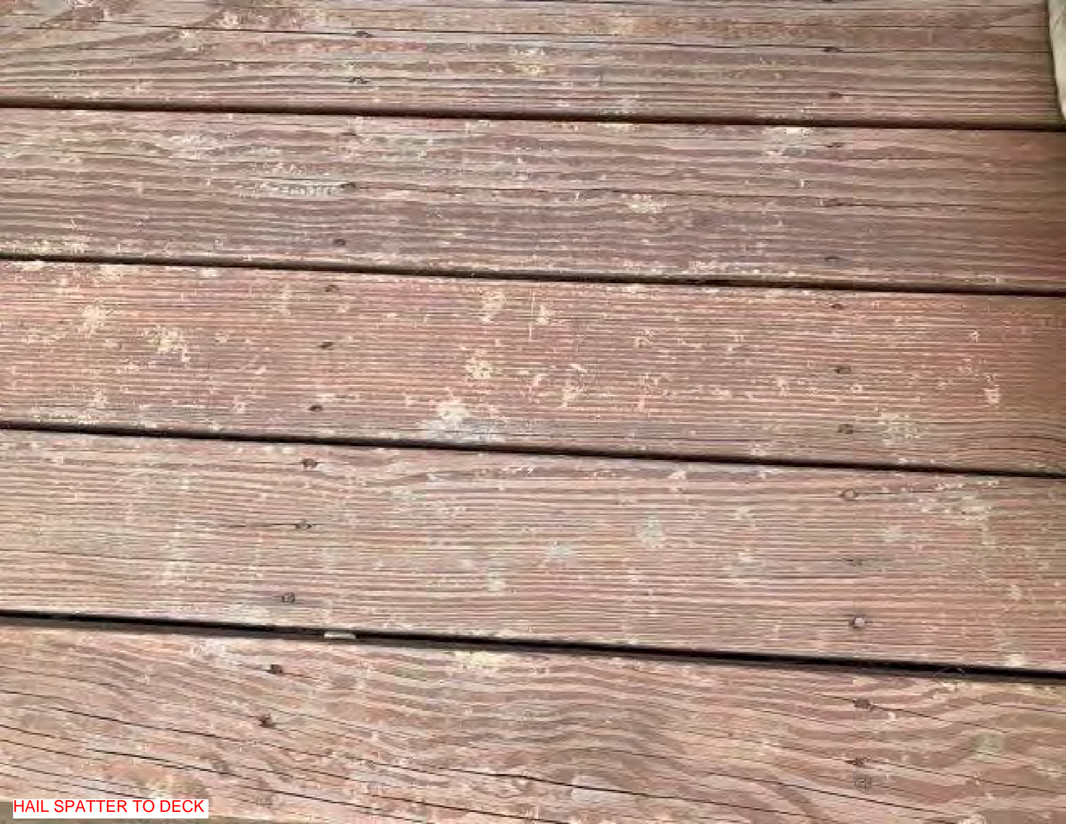
HAIL SPATTER TO DECK