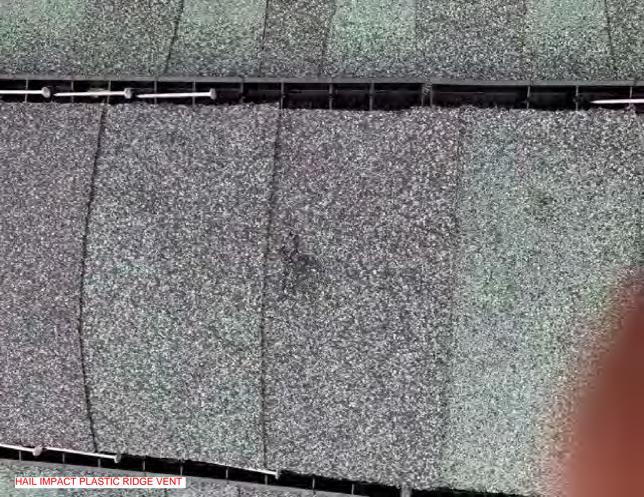
HAIL IMPACT PLASTIC RIDGE VENT