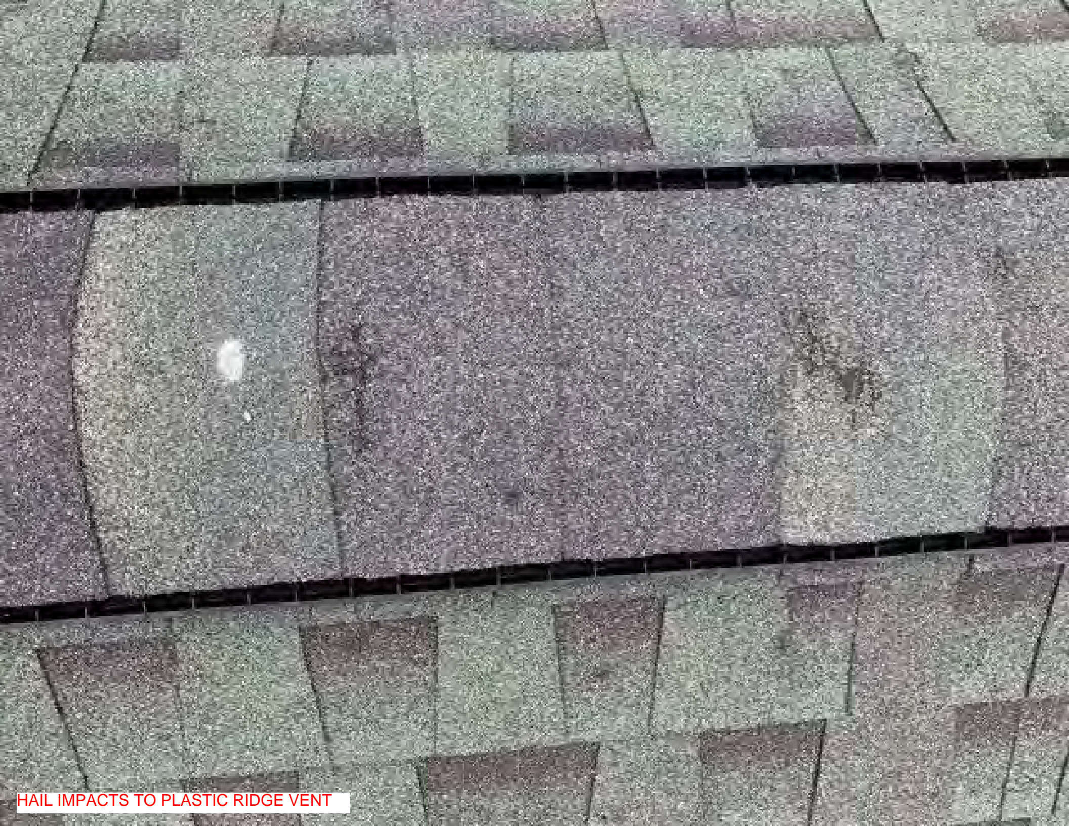
HAIL IMPACTS TO PLASTIC RIDGE VENT