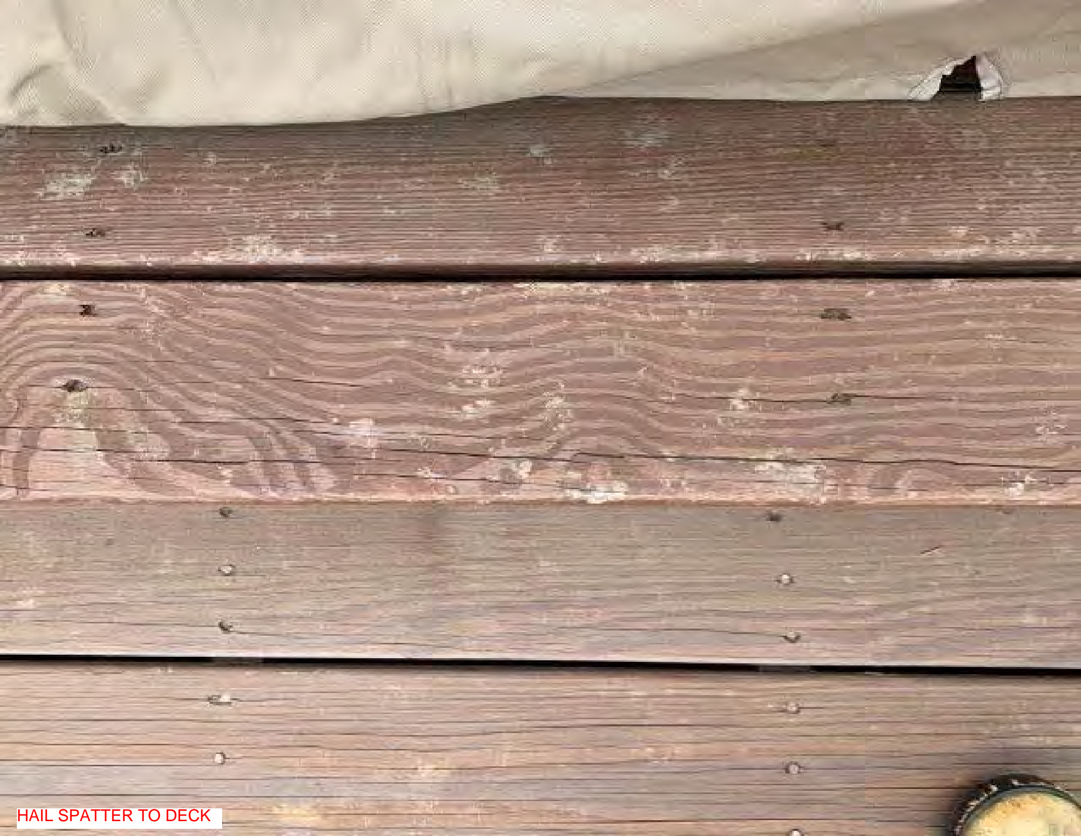
HAIL SPATTER TO DECK