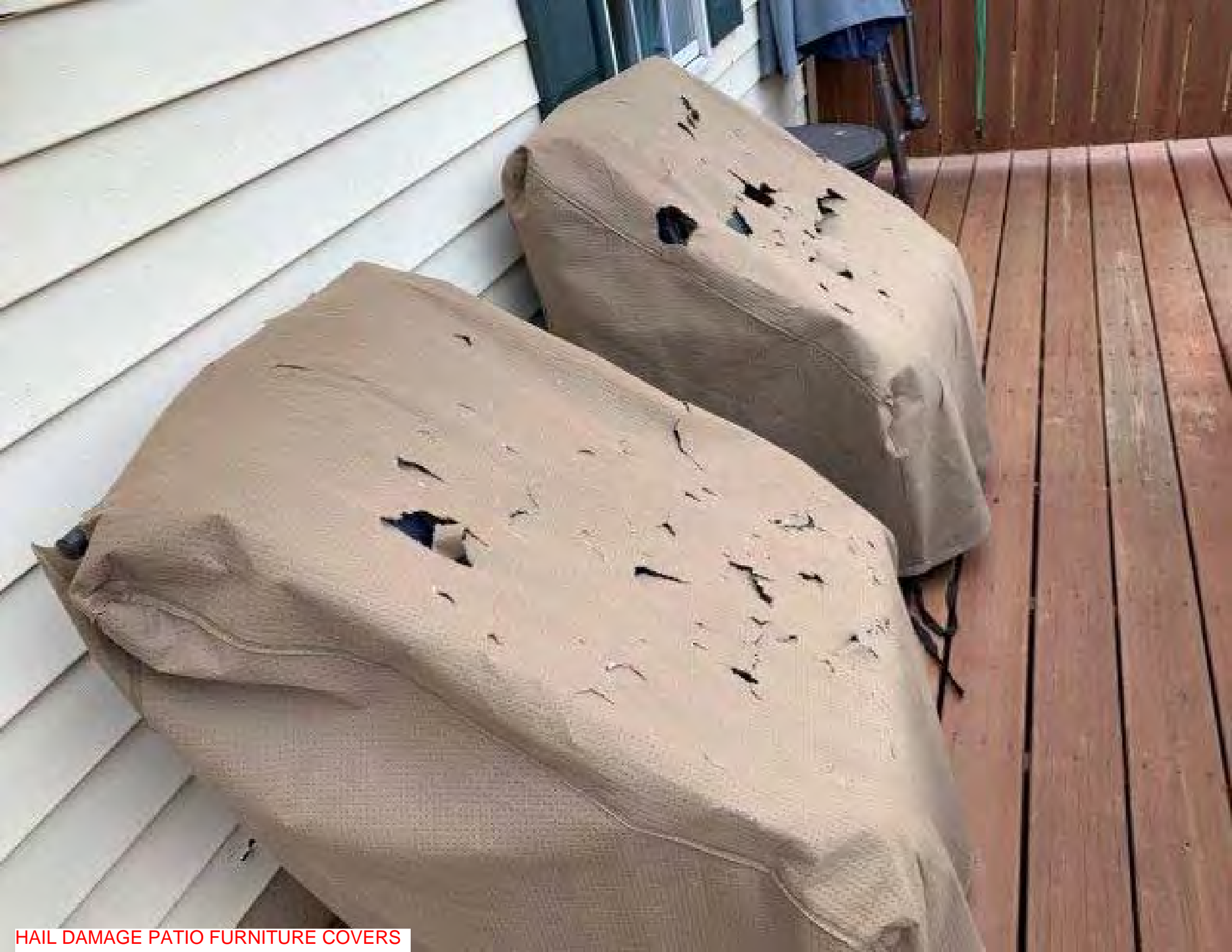
HAIL DAMAGE PATIO FURNITURE COVERS