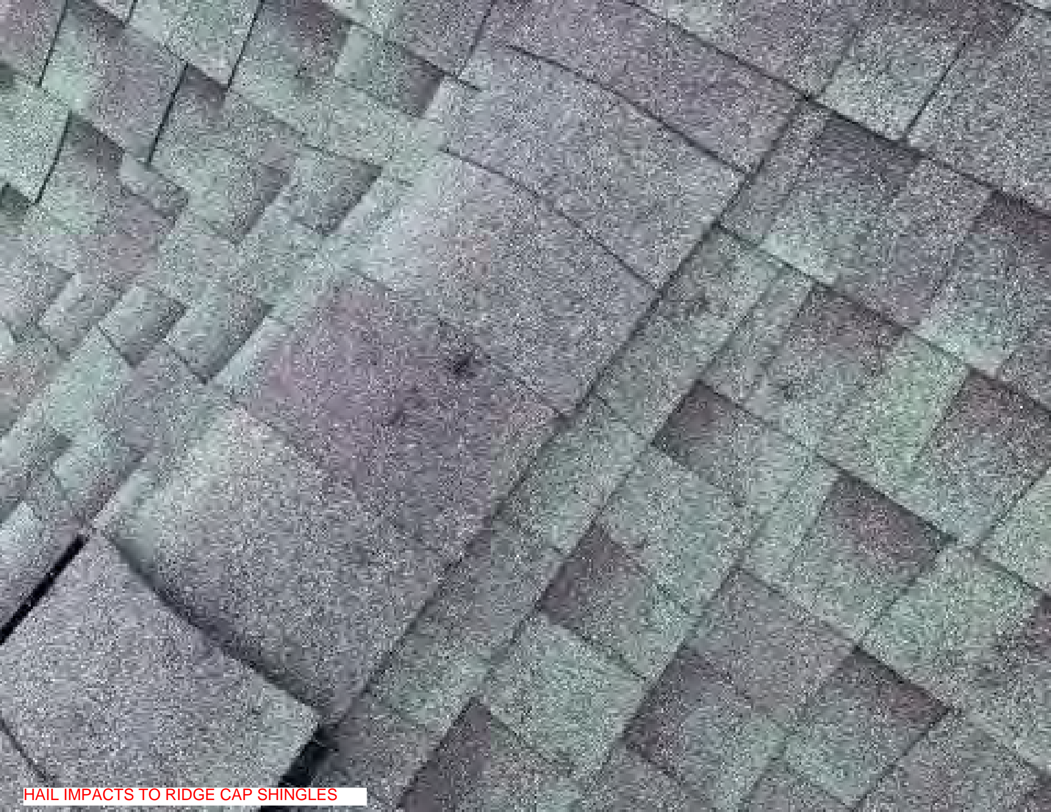
HAIL IMPACTS TO RIDGE CAP SHINGLES