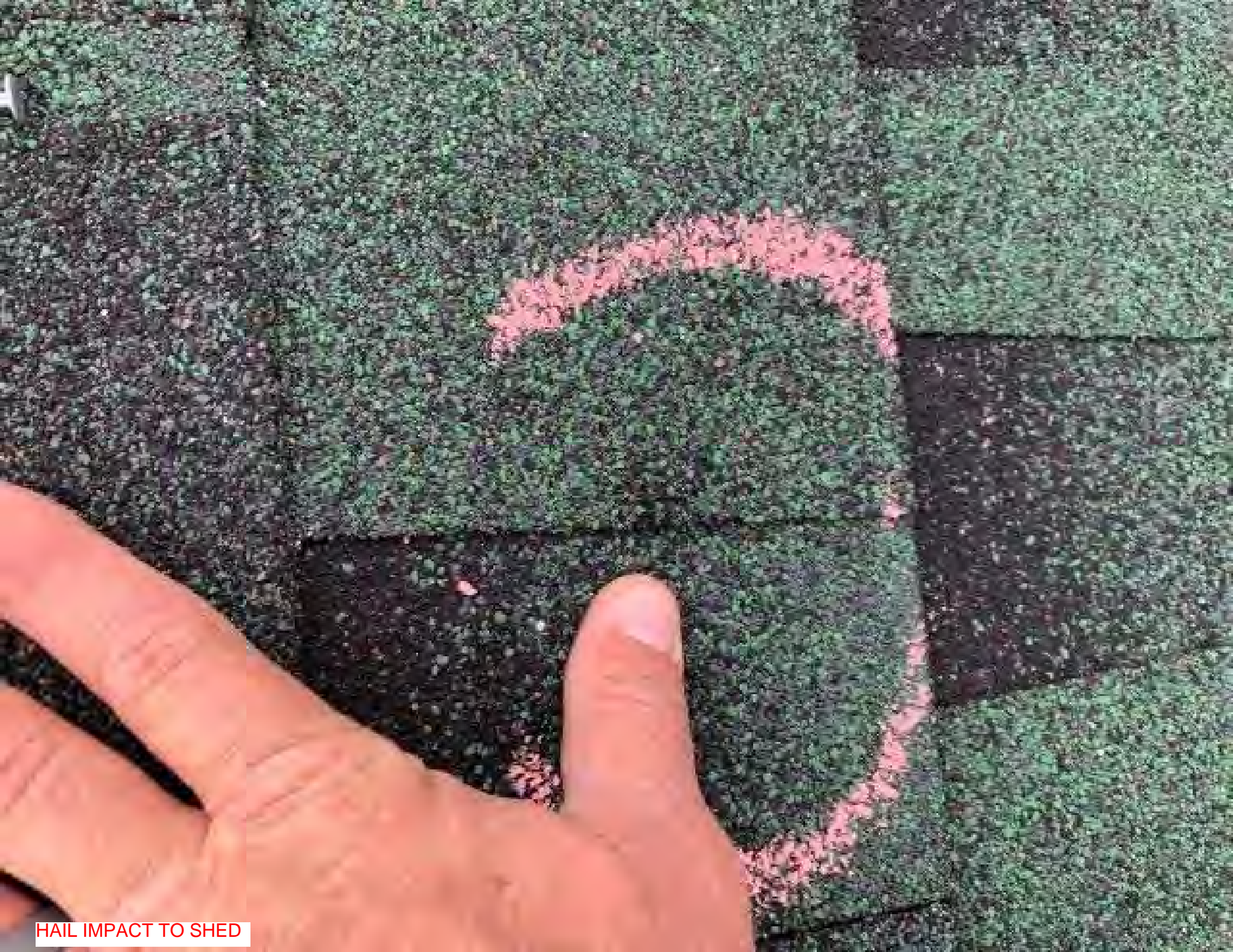
HAIL IMPACT TO SHED