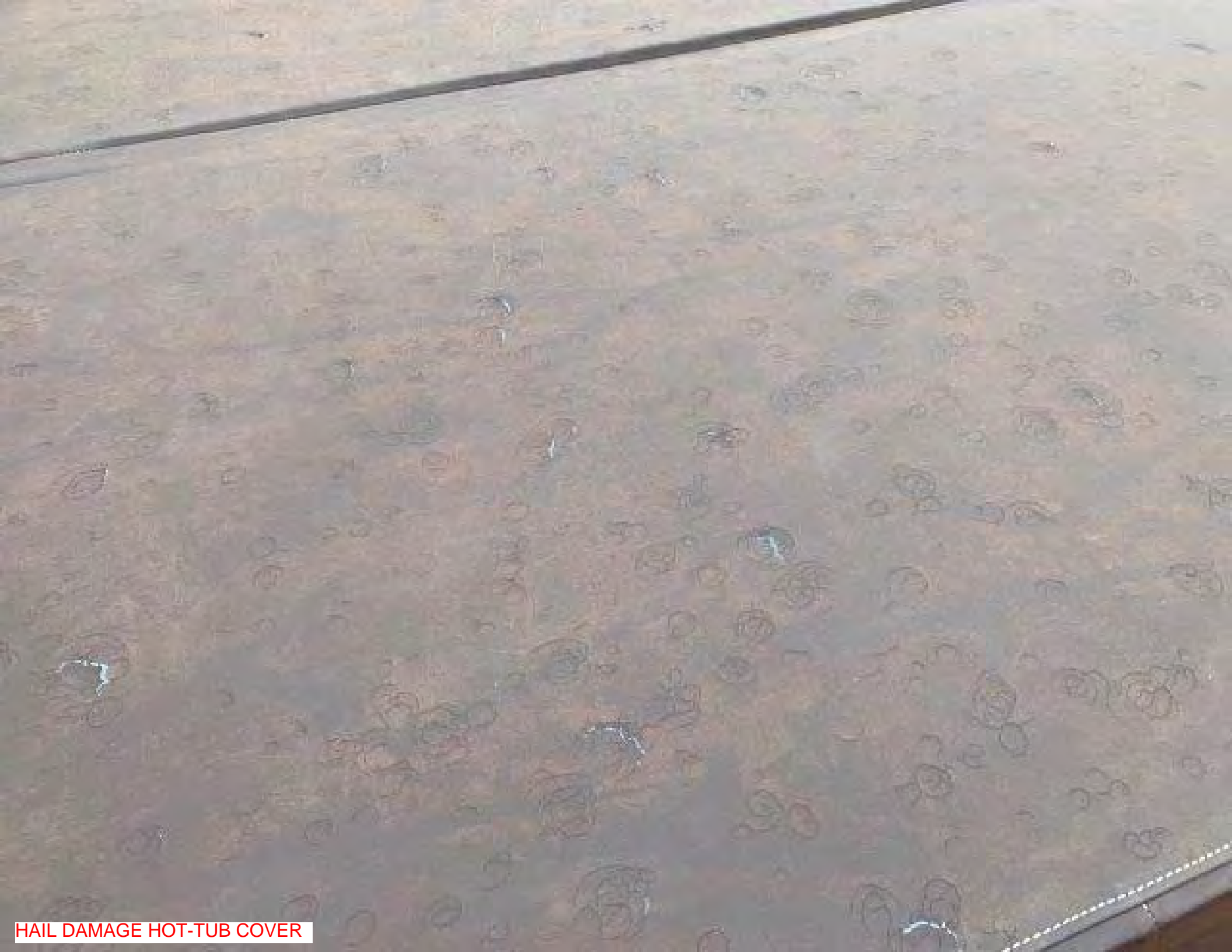
HAIL DAMAGE HOT-TUB COVER