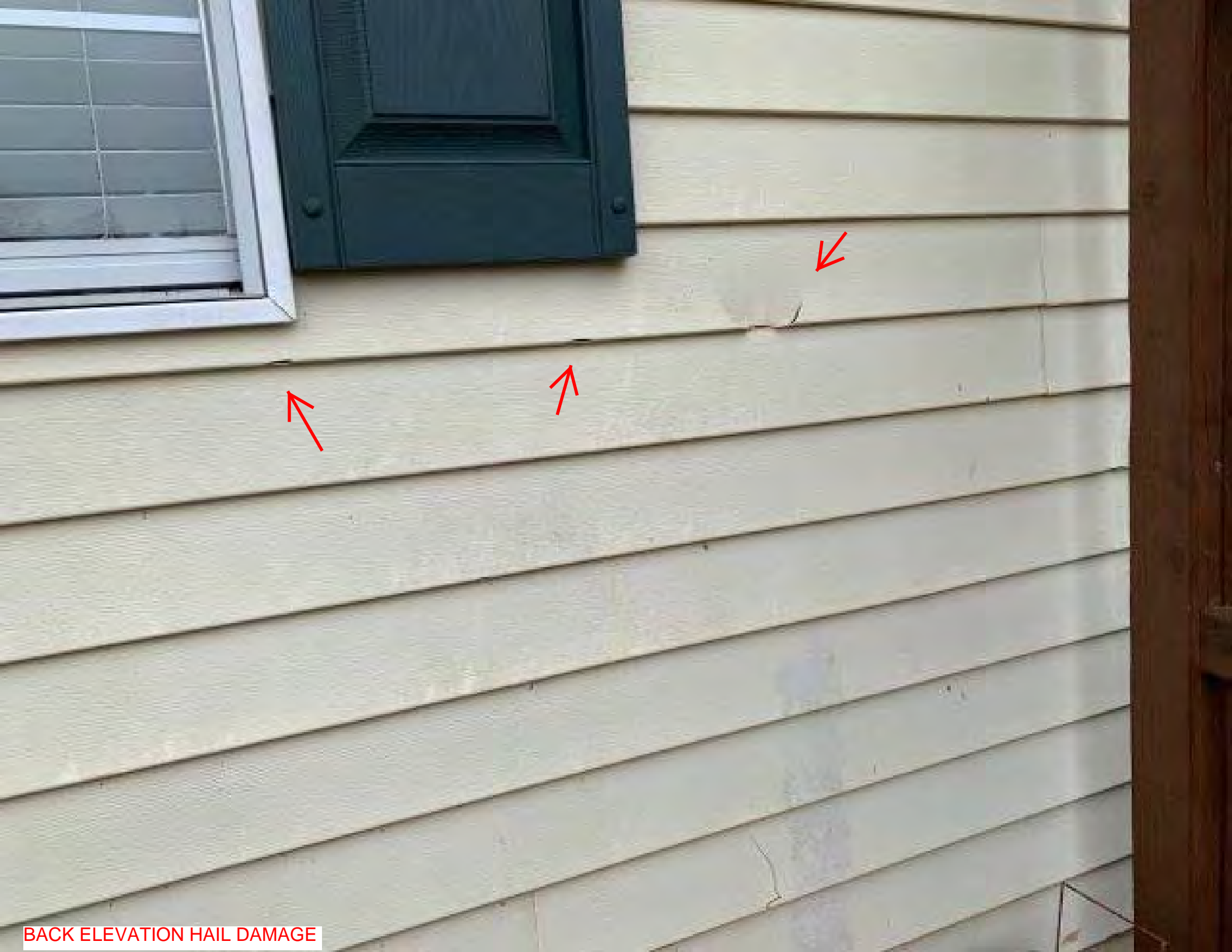
BACK ELEVATION HAIL DAMAGE